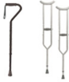
Canes & Crutches